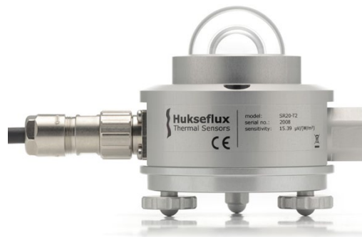
Figure 7 SR20 pyranometer with its sun screen removed

Whatever your application is, Hukseflux offers the highest accuracy in every class at the most attractive price level.