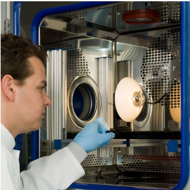
Figure 6 Temperature response testing at Hukseflux