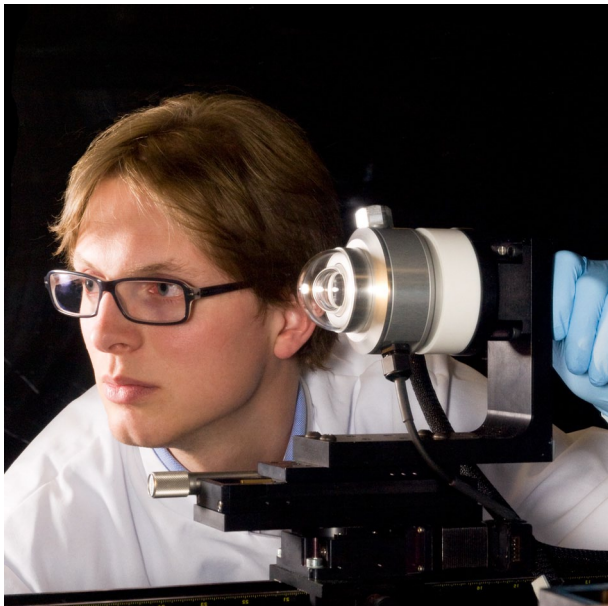
Figure 2 Directional response testing at Hukseflux