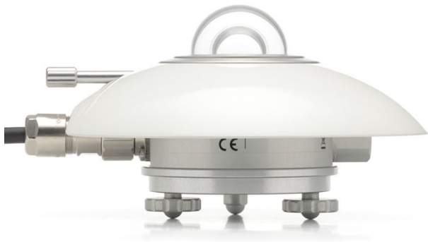
Figure 1 SR20 secondary standard pyranometer

Hukseflux invested more than 10 man-years in developing the infrastructure to manufacture, test and calibrate a secondary standard pyranometer. These efforts resulted in the SR20 secondary standard pyranometer, released February 2013.