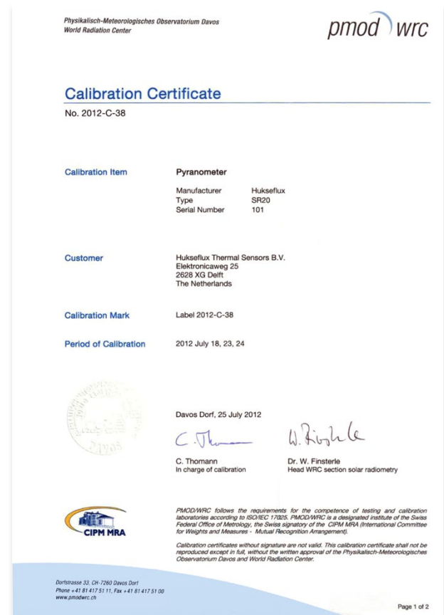
Figure 4 PMOD certificate of SR20

For contact details, please visit www.hukseflux.com