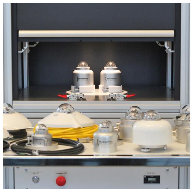
Figure 2 Calibration of all major pyranometer brands and models.