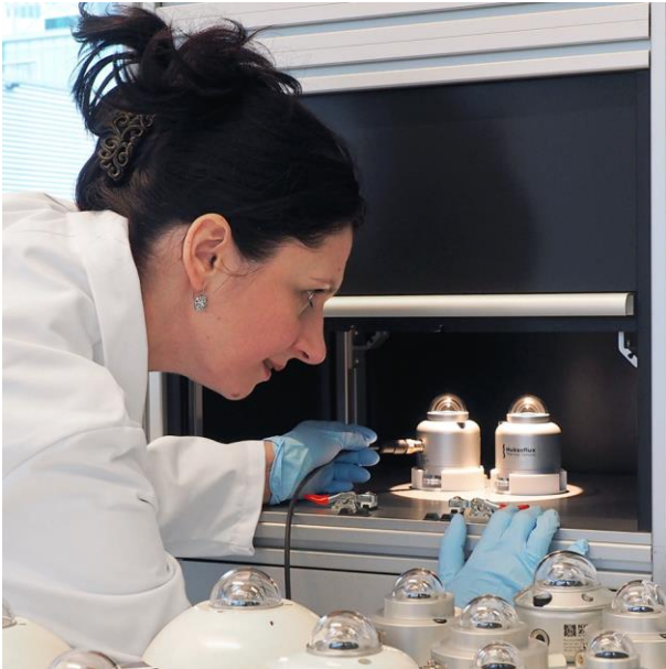
Figure 3 A typical calibration system at Hukseflux.