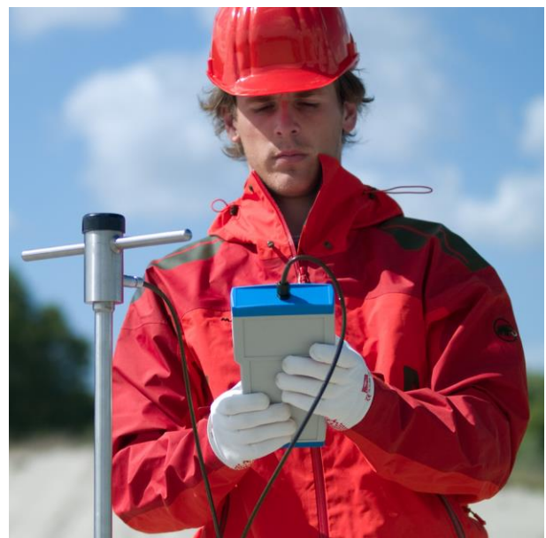
Figure 2 FTN02 being used in an on-site (field) survey

FTN02 is a thermal needle measuring system for on-site measurements of thermal conductivity (or the inverse value, resistivity) at depths from the surface down to a depth of 1.5 metre. Due to its robustness and length, FTN02 is the best solution for route-surveying of high-voltage electric power cables and heated pipelines (typical depth of burial of 1.5 m). The measurement method is based on the use of a "thermal needle". This method employs a heating wire and a temperature sensor in a needle. The FTN02 system consists of the thermal needle, model TP09, mounted on a long lance, LN02, and a control and readout unit CRU02. FTN02 is easy to use. After making a small-diameter access hole, the thermal needle TP09 is brought down to just above the point that must be investigated and then pushed into the local undisturbed soil below. The user performs control and readout of the measurement from the handheld CRU02.