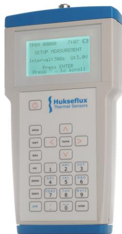
Figure 4 FTN02: CRU02 control and read out unit