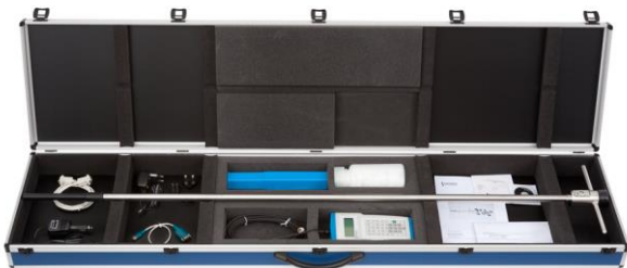
Figure 5 The complete FTN02 system: FTN02 includes one spare sensor TP09, adapters for charging the system in the office, WSA02, and in an automobile, CA02. Also included are communication software and a jar for glycerol. Glycerol must be purchased locally.