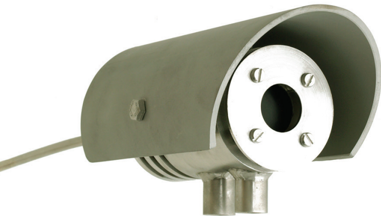
Figure 1 HF02 flare radiation monitor / heat flux sensor

HF02 is a sensor that measures radiant heat flux or thermal radiation in the outdoor environment. A common application is monitoring the radiation emitted by flares. HF02 is certified for use in potentially explosive atmospheres, and is rated for radiation levels up to 15 \times 10^3 \text{ W/m}^2 . We recommend use of HF02 in a decision-supporting role only, and not to use measurements of HF02 as the main or sole source of information for judging safety.