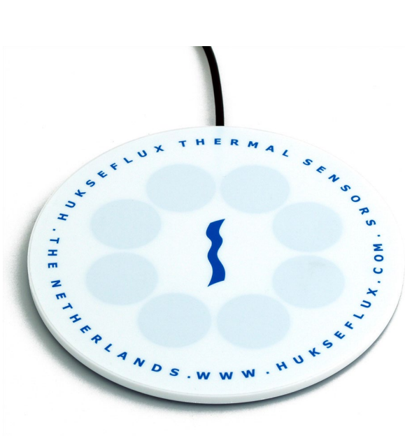
Figure 1 HFP03 ultra sensitive heat flux plate

HFP03 is an ultra sensitive sensor for measurement of small heat fluxes in the soil as well as through walls and building envelopes. The total thermal resistance is kept small by using a ceramics-plastic composite body. See also model HFP01 : putting several HFP01 sensors electrically in series is an alternative for using HFP03.