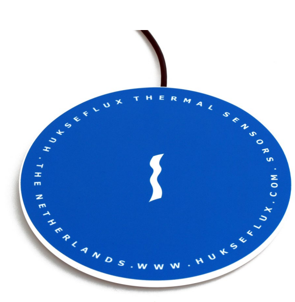
Figure 2 opposite side of HFP03, which has a blue coloured cover