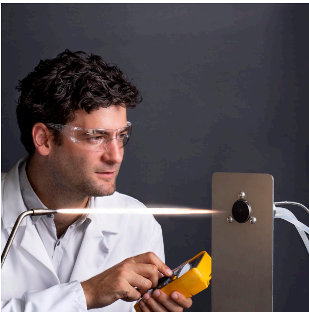
Figure 2 HFS01 is the sensor of choice for studies of concentrated sun and high-intensity flames