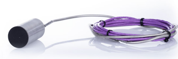
Figure 4 HFS01, pictured without flange, with cabling

Using HFS01 is easy. It can be connected directly to commonly used data logging systems. The heat flux, in W/m^2 , is calculated by dividing the HFS01 output, a small voltage, by the sensitivity. The sensitivity is provided with HFS01 on its product certificate. Equipped with heavy-duty cabling and a fully stainless steel casing which prevents moisture from penetrating the sensor, HFS01 has proven to be very reliable.