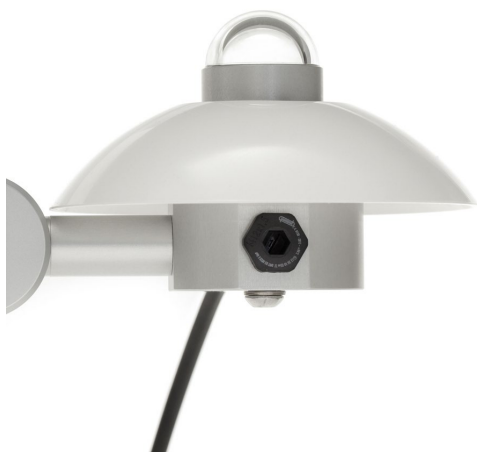
Figure 4 RA01 2-component radiometer in detail: pyranometer model SR01.

Applicable instrument-classification standards are ISO 9060 and WMO-No.-8; Guide to Meteorological Instruments and Methods of Observation.