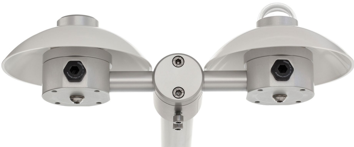
Figure 1 RA01 2-component radiometer.

RA01 is a market leading 2-component radiometer, mostly used in scientific-grade energy balance and surface flux networks. It offers 2 separate measurements of solar and longwave radiation with a pyranometer and a pyrgeometer. Product features include a modular design, low weight, and easy levelling, and low solar offsets in the longwave measurement. The unique capability to heat the pyrgeometer reduces measurement errors caused by dew deposition. When combined with estimates of solar albedo and of local surface temperature, this instrument can also be used for estimation of net radiation. The advantages of this approach are cost reduction and independence from local surface properties.