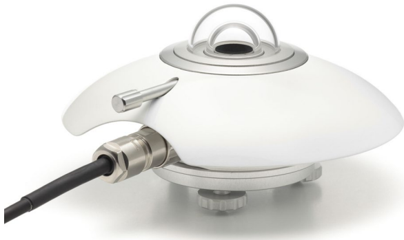
Figure 5 SR22 side view.