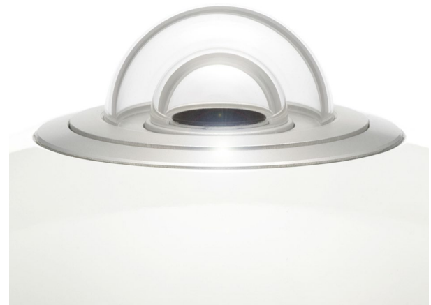
Figure 4 The inner and outer quartz domes of SR22 allow users to utilise SR22's extended spectral range.

Applicable instrument classification standards are ISO 9060 and WMO-No. 8. Included in delivery as required by ISO 9060: test certificates for temperature response and directional response. Calibration is according to ISO 9847. PV related standards are IEC 61724 and ASTM E2848.