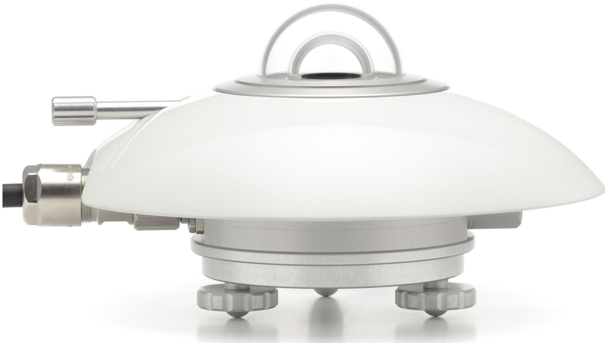
Figure 1 SR22 Class A pyranometer.

SR22 is a solar radiation sensor of the highest category in the ISO 9060 classification system: spectrally flat Class A. On top of the features and benefits of the successful SR20 pyranometer, SR22 has domes made of high-quality quartz, resulting in an extended spectral range. Covering the full solar spectrum, SR22's extended spectral range potentially offers lower measurement- and calibration uncertainties compared to pyranometers with glass domes. SR22 is typically used in high-accuracy reference stations.