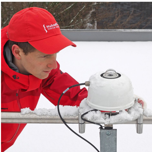
Figure 2 SR22 sensor combined with VU01 ventilation unit.