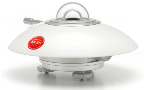
Figure 2 SR25 pyranometer with sapphire outer dome

* NOTE: the fact that a sensor is used or tested does not constitute a formal endorsement by the user or test institute.