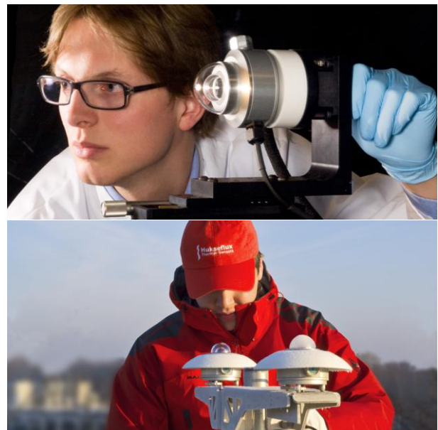
Figure 4 extensive testing of sensors, here indoors at Hukseflux and outdoors on a frosty morning: clear difference between SR25 (left), versus an unheated pyranometer without sapphire dome (right)