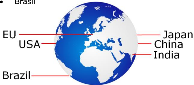
Figure 5 worldwide calibration and service facilities