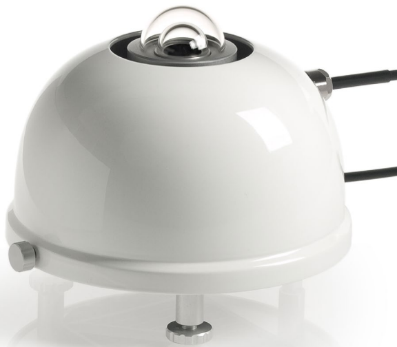
Figure 1 VU01 ventilation unit with pyranometer SR20.

VU01 is a high-quality ventilation unit for use with pyranometers and pyrgeometers. Its purpose is to improve the dependability of the measurement. Measurement accuracy improves because offsets are reduced. Reliability benefits from mitigation of dew and frost and quick evaporation and sublimation of water and snow. ISO/TR 9901 "Solar Energy - Field Pyranometers - Recommended practice for use" recommends use of ventilators where high accuracy and reliability are required.