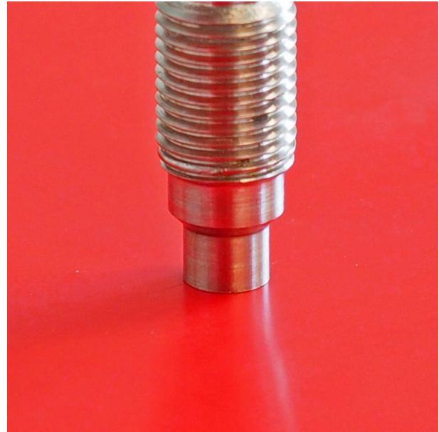
Figure 3 spin-off: NOS03 sensor is surface mounted