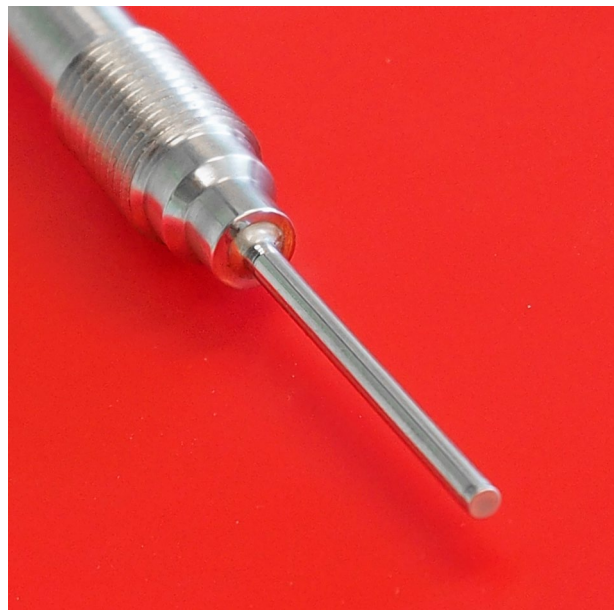
Figure 1 thermal needle type NOS01; available as a commercial product. NOS01 is inserted in the melt flow

The project has successfully resulted in two commercial products: NOS01 and NOS03.