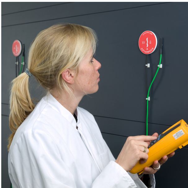
Figure 4 TRSYS01 system in use for building envelope thermal resistance measurement