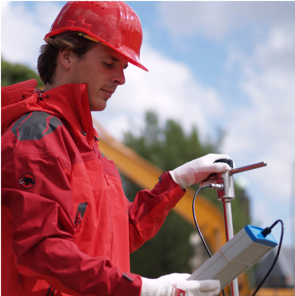
Figure 1 Example of an application of Hukseflux thermal conductivity measuring systems: thermal route survey

Hukseflux is a leading manufacturer of thermal conductivity measuring systems and sensors. This brochure offers general guidelines for choosing the right system or sensor for your application. Cannot find what you are looking for? Ask us for alternatives. Hukseflux also offers material characterisation testing services.