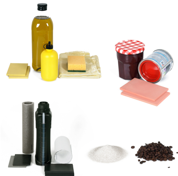
Figure 2 Example of materials of which thermal properties can be determined with Hukseflux measuring systems and sensors: common samples are plastics, paints, composites, pastes and fluids

Hukseflux is able to offer highest quality products at an acceptable price level. If we cannot offer you an acceptable solution ourselves, we will tell you who can. Please contact us for further assistance.