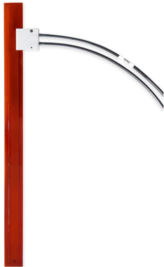
Figure 1 STP01 soil temperature profile sensor is applied in many large scale networks.

STP01 accurately measures the temperature profile of the soil at 5 depths close to its surface. It is used for scientific grade surface energy balance measurements. The sensor is buried and usually cannot be taken to the laboratory for calibration. The on-line self-test using the incorporated heating wire offers a solution to verify STP01's measurement stability.