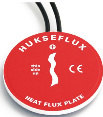
Figure 4 STP01 is often used in combination with HFP01SC self-calibrating heat flux sensor, shown in the picture