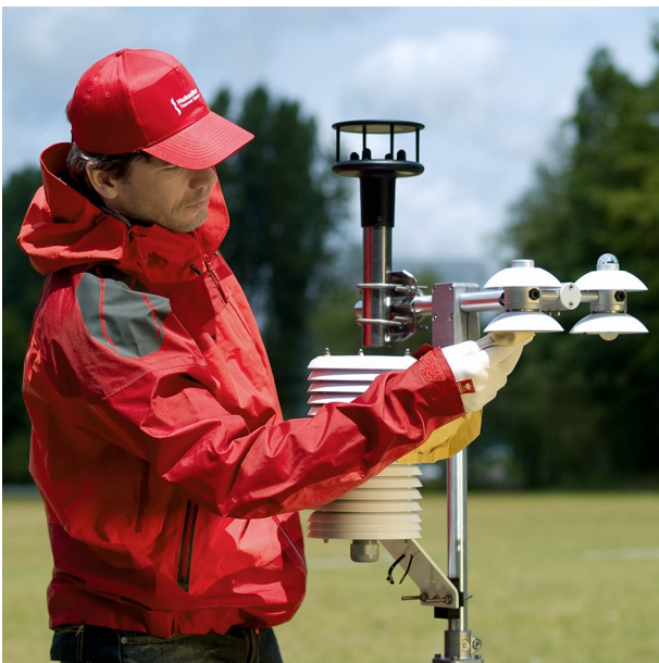
Figure 2 STP01 is often used in meteorological surface energy flux measurement stations