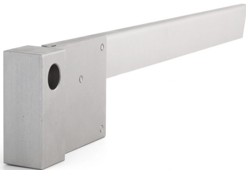
Figure 3 IT01 insertion tool is hammered down into the soil. After retracting it leaves a slit in which STP01 may be inserted

For ease of installation with a minimum of disturbance of the local soil, Hukseflux offers IT01 insertion tool.